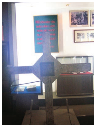
Photos of the cross at Long Tan and of the original Cross in the museum at Bien Hoa