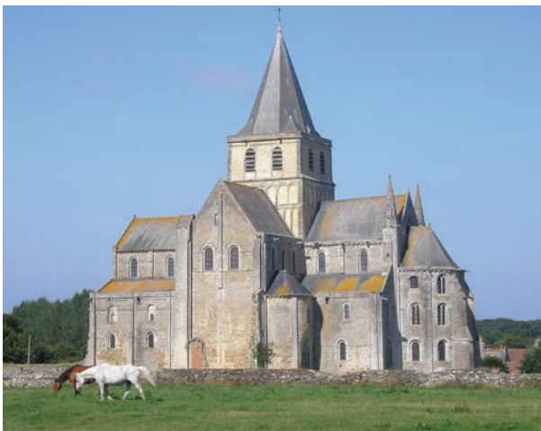
Cerisy-la-Forêt (Normandie, France) the town bears the name of Cerisy Abbey

They could have just ignored the situation as somebody else's problem and continued with their own bridging task. Instead, this is what they did.